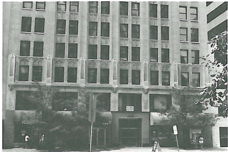
APS Headquarters is located now within three blocks of the White House in this 11-story building at 1010 Vermont Avenue, NW, Washington, DC. (OK, OK, maybe it's five blocks, but that's the maximum.)