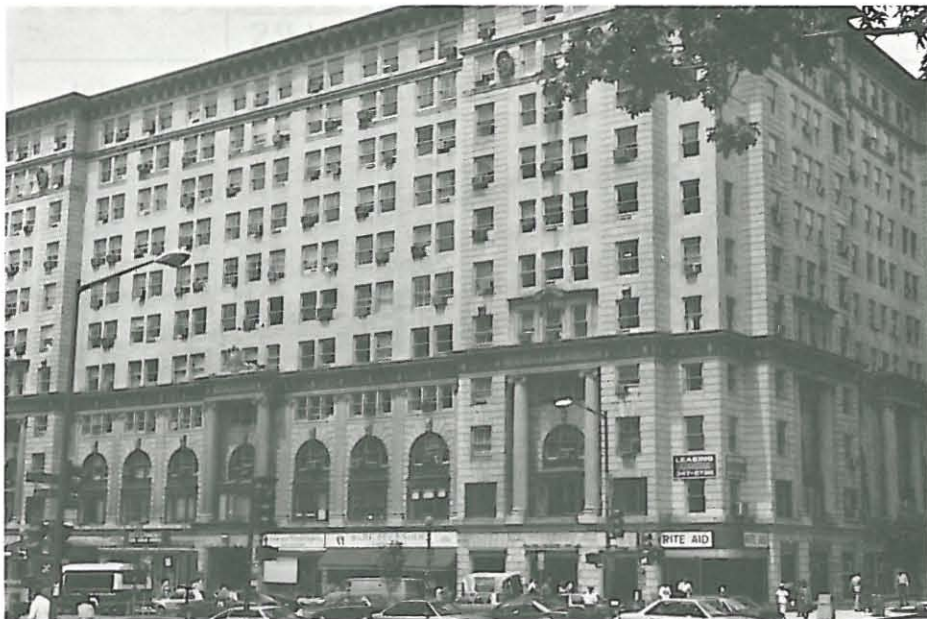
APS outgrew its office space within 21 months of occupying its former residence on the third floor of the Investment Building (above) at 1511 K Street, NW, in Washington, DC.

moderate increasing space requirements as the permanent Washington staff took on more of the tasks being given up by the Oklahoma logistics office and the Nevada newsletter office.