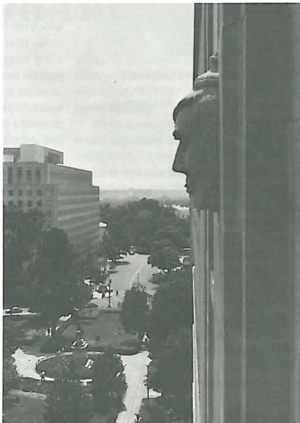
The new APS office overlooks McPherson Square ( foreground ) and the White House ( at center of photo — look closely, it really is there ).

characterized this third office relocation as being "like a toddler's first successive three steps. When the toddler can do three in a row on its own, the parent rejoices that the child can now walk!" APS has established that it can "walk" by asserting its credibility on Capitol Hill and with federal agencies (e.g., NIH, NSF) over the