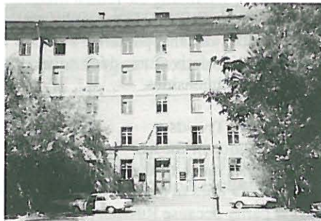
The Russian Institute of Psychology in Moscow. The fifth floor houses the National Humanitarian Foundation, which provides some research funding for the Institute.