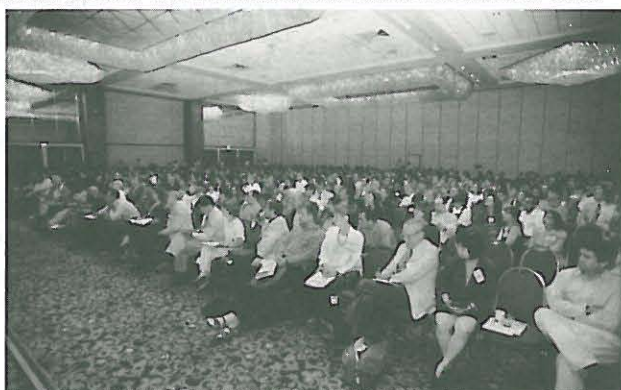
Nearly 1,000 attended the 1995 Presidential Symposium to hear top researchers explore scientific merits of and premises underlying debate on differences in intelligence.

The 2,100 attendance figure was on a par with previous APS convention attendance levels, but more than ever before the conference participants represented the full spectrum of all subdisciplines of psychological science. And participants and attendees ranged from fledgling undergraduates to senior