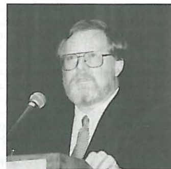
Ramey cites accessible studies that refute basic tenets of the Bell Curve relating to cognitive abilities.

"We need to go beyond the nature-nurture controversy and bring nature and nurture together to help us to understand the complex developmental interaction in which genotypes become phenotypes," he concluded.