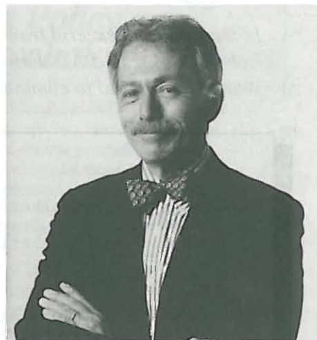
Floyd Bloom, according to many behavioral scientists, understands the continuity of behavioral science and neuroscience better than many and is a good choice for editor.

Bloom elaborated, "My interest in the central nervous system was heightened by the side effects of the drug reserpine, which was being used to treat hypertension. What was really astounding in that era [early-1960s] was that reserpine also caused mental depression in a significant number of people." With some people becoming suicidally depressed, Bloom was keenly interested in how this drug worked. And at that time Seymour Kety and Joseph Schildkraut were in the process of developing the catecholamine hypothesis of depression. "There seemed to be a common link between the drug's actions in animal