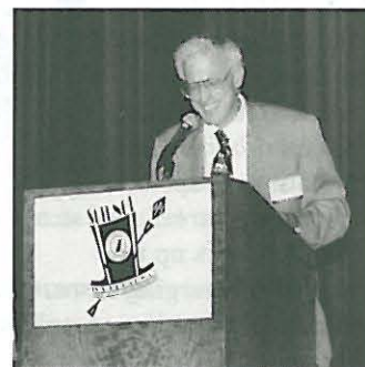
Sternberg demonstrates common misuses of good psychological tests by bureaucratic schools.

An IQ score is not all based on intelligence, and there is a lot more to intelligence than IQ. Intelligence can be taught, as shown by major gains in treated versus control groups. Tests measure only a small part of what is necessary for success in school and on the job. Task knowledge does not correlate with IQ, and IQ is not a good predictor of job success. Tests are being vastly overused in educational settings. For example, GRE scores predict nothing but first-year grades, he said.