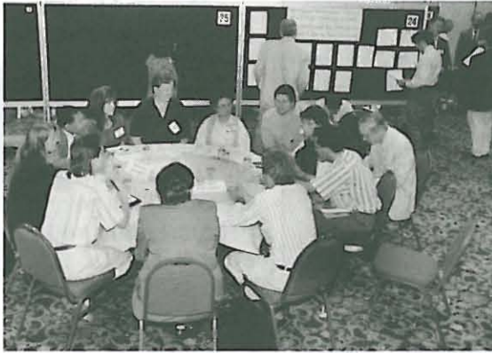
One of the nearly 30 Participant Idea Exchange round-tables where specific classroom and teaching topics were discussed.