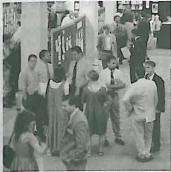
The seventh annual APS Convention featured over 900 poster presentations.