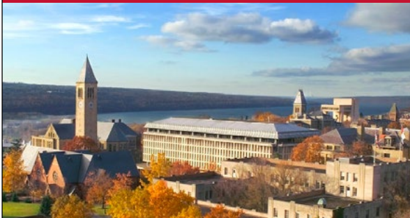
Robert J. Sternberg 2017 APS William James Fellow Award